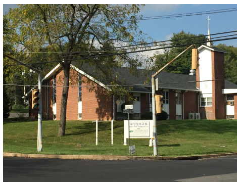
3-2 votes at what was known as the Reformed Church, now Crossroads Fellowship Church, at the intersection of North Hills Ave., Fitzwatertown and Woodland.