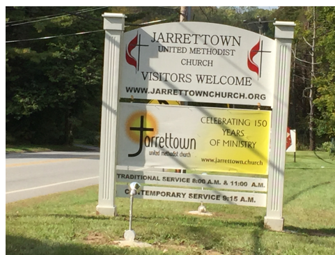
3-1 votes at Jarrettown United Methodist Church on Limekiln.